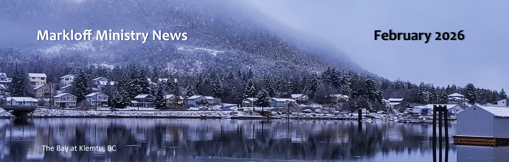
The Bay at Klemtu, BC