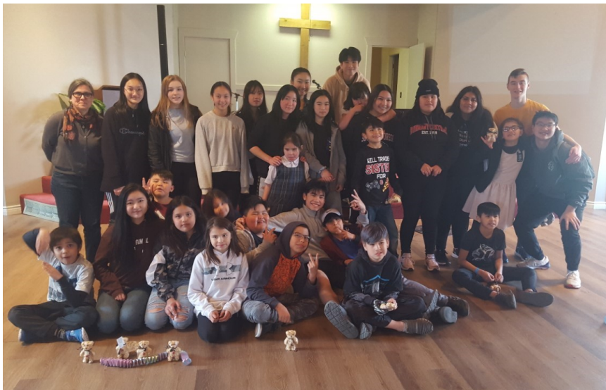
Vancouver Christian High School students came to serve the SAY YES! program for a week just before Spring Break in March. They were so good with the children and made a lasting impact on our group.