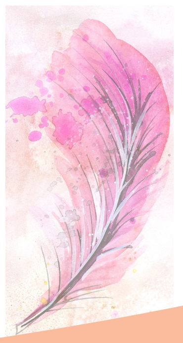
NAIM staff and the ministries they represent are solely funded through and fully accountable to North America Indigenous Ministries.

VIRTUAL GATHERING REQUEST Please continue to pray for all those who (virtually) attend this bi-monthly Zoom online/phone gathering for those in Native ministry!