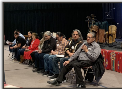
Native Leaders Panel

Much prayer and many generous donations contributed to the success of TMC 23. Thank you for your part.